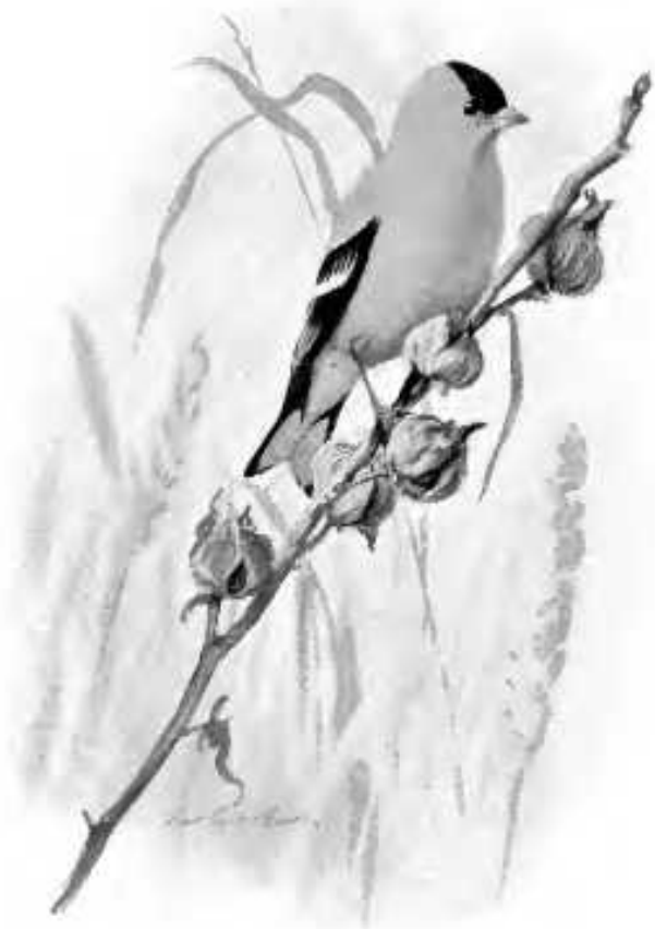
GOLDFINCH (page 105)