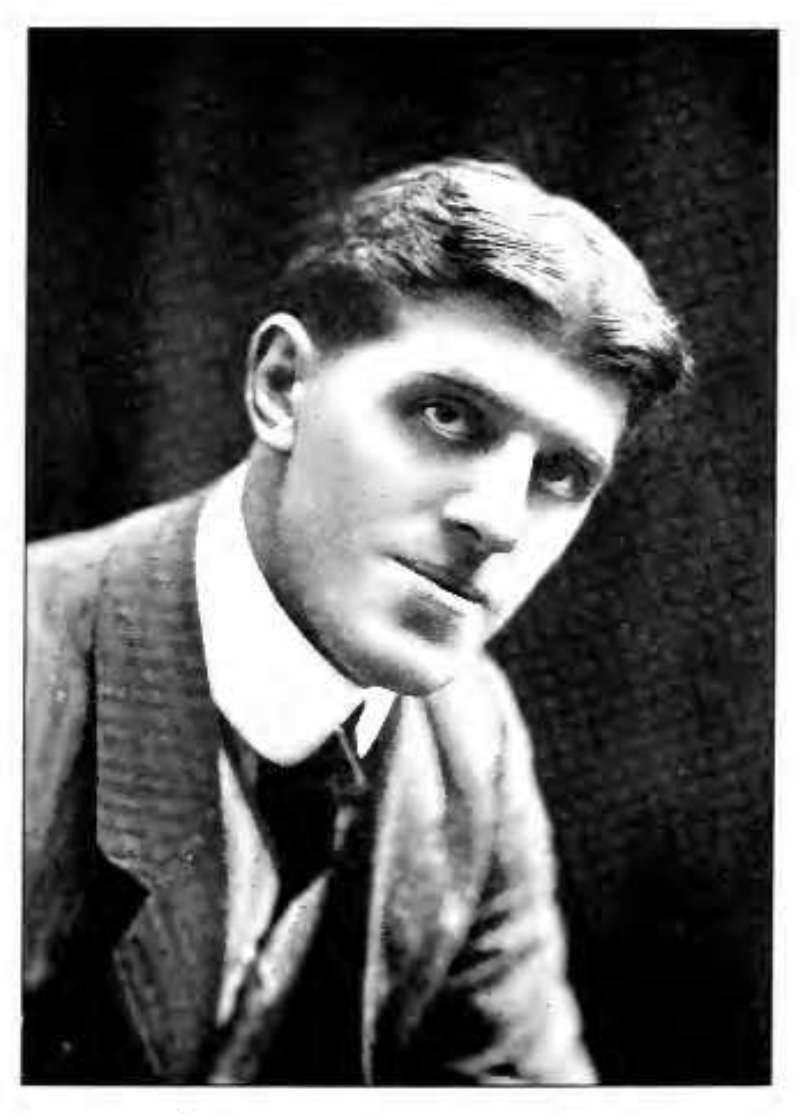
Sweerely Journ As B Harley