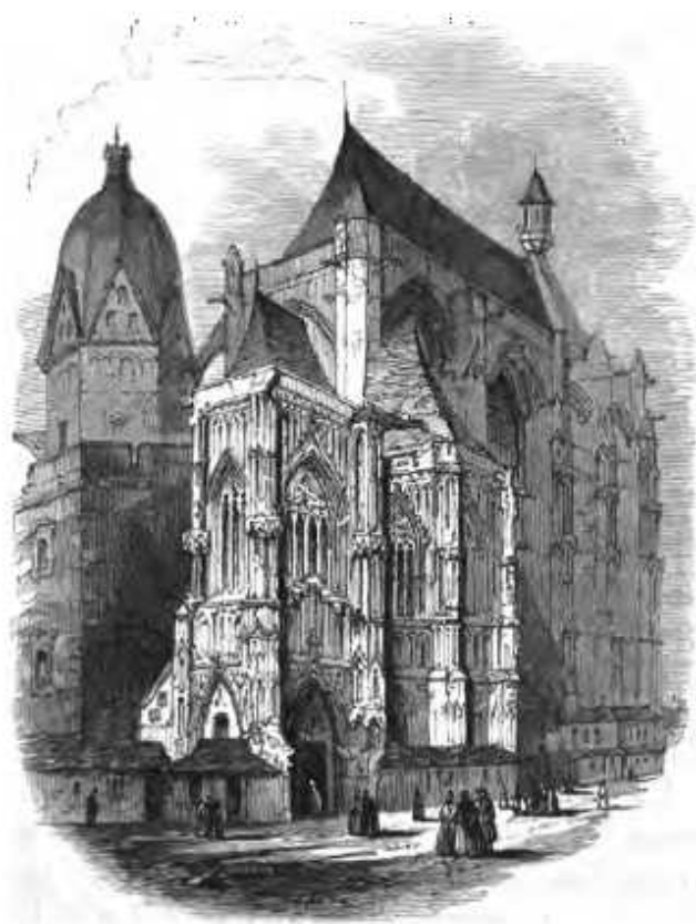
CATHEDRAL OF AIX LA CHAPELLE.