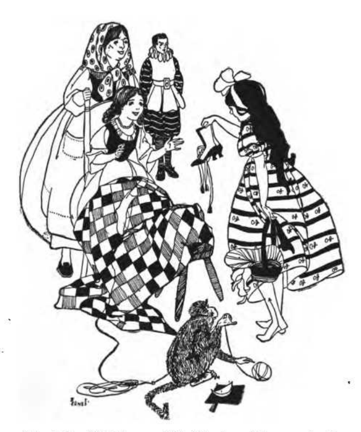
"The little wilful Princess pulled off her beautiful, new, red-gold spangled boots."