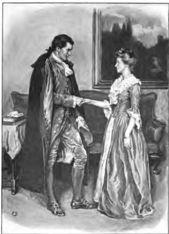
"He held her hand in his own for a little while"