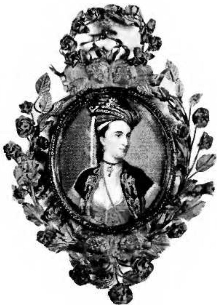
LADY MARY WORTLEY MONTAGU: