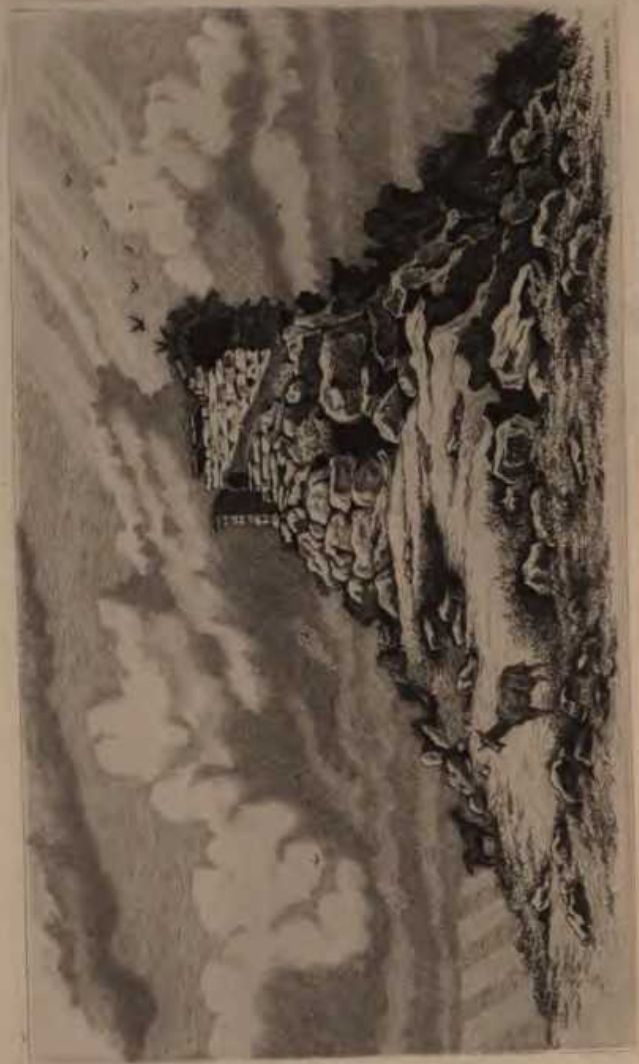
PAGAN SEPULCHRAL TUMULUS SURMOUNTED BY A CHRISTIAN ORATORY ON CHATEL CARR BREA HILL, IN THE PARISH OF ST. JUST. (After an original drawing by Dr. Borlase.)