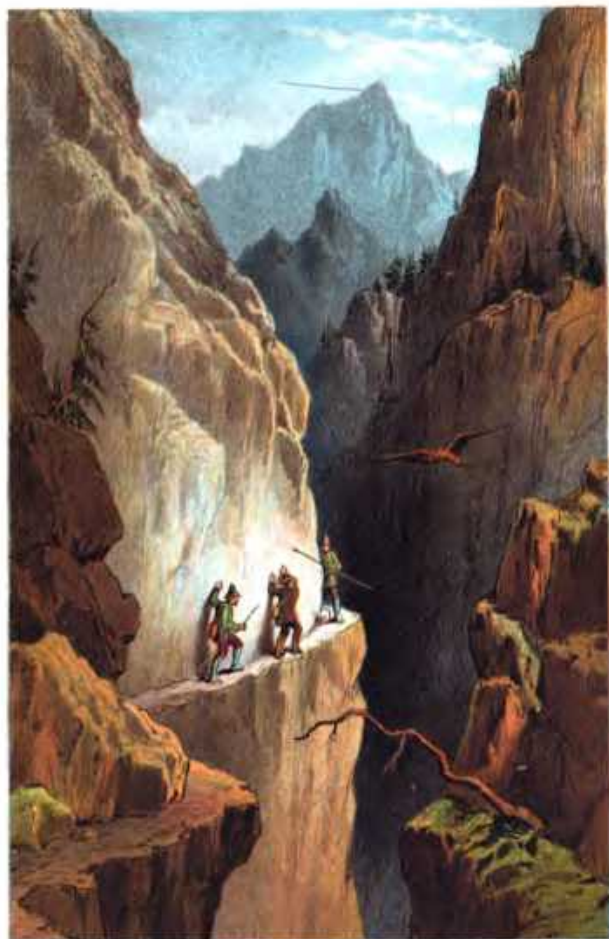
THE MAUVAIS PAS page 23.