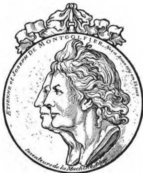
MEDALLION SHOWING BROTHERS MONTGOLFIER.

Then and there the brothers resolved on an