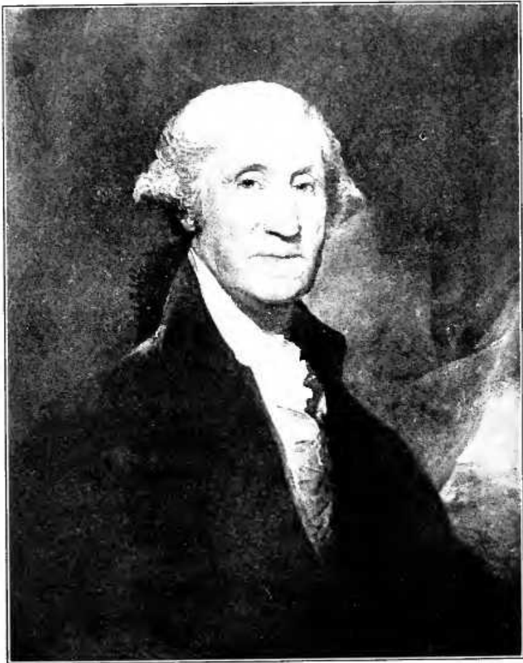
George Washington, the first Pittsburger