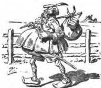
King Richard traveling incog. through Germany

WHEREIN WILL BE FOUND A RECITAL OF THE MANY EVENTFUL EVENTS WHICH TRANSPIRED IN ENGLAND FROM THE DRUIDS TO HENRY VIII. THE AUTHOR DOES NOT FEEL IT INCUMBENT ON HIM TO PRESERVE MORE THAN THE DATES AND FACTS, AND THESE ARE CORRECT, BUT THE LIGHTS AND SHADES OF THE VARIOUS PICTURES AND THE ORNAMENTAL WORDS FURNISHED TO ADORN THE CHARACTERS AND EVENTS ARE THE SOLE INVENTION OF THIS HISTORIAN.