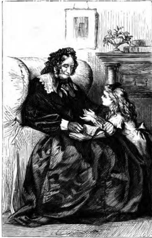
LUCY.—(See page 108.)