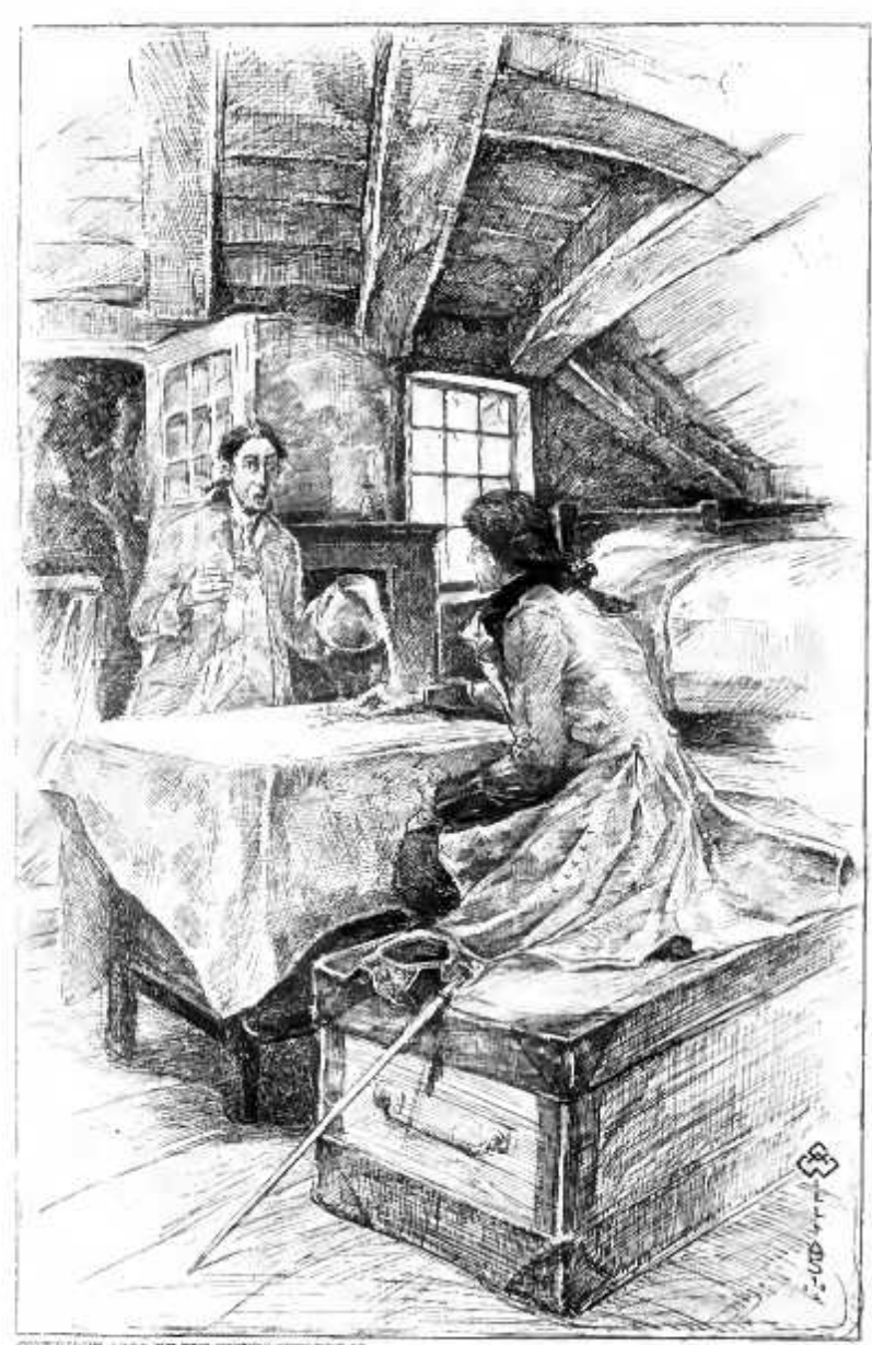
CONTRINED LIDE BY THE OFTNERSTEP PARES.