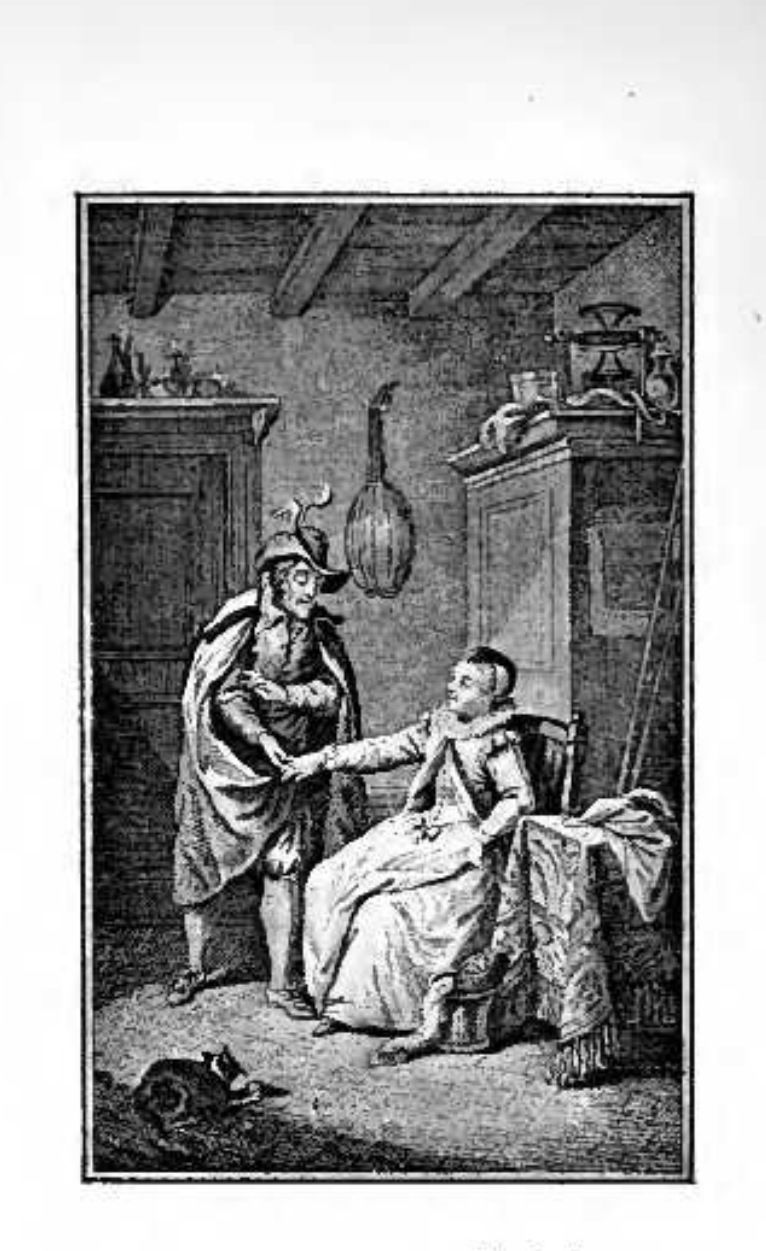
DAY I; TALE VIII.