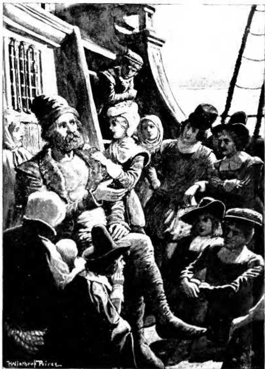
The pilot telling the story of Hudson.