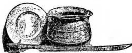
Sword, pot, and platter of Miles Standish.