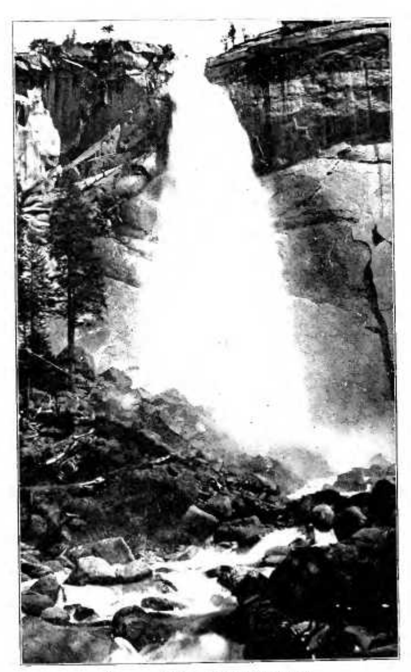
Newaday Fales (height 617 feet). Yesemite Valley.