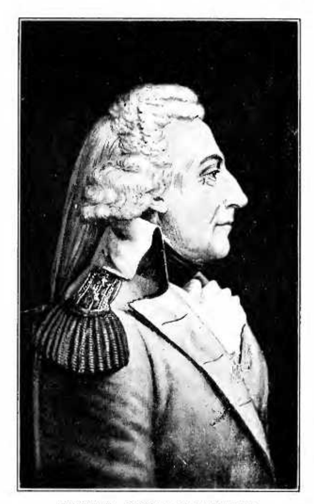
GENERAL JOSEPH BLOOMFIELD