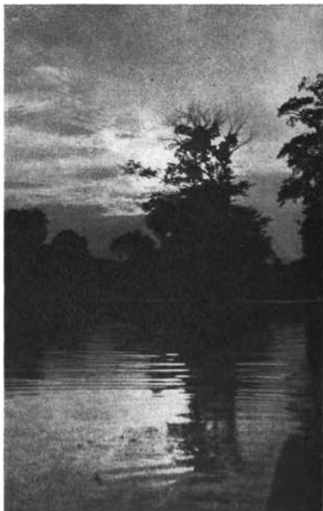
"The day's farewell to the summer night." In Michigan