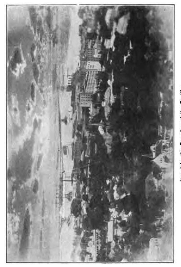
Honolulu, the Paradise of the Pacific.