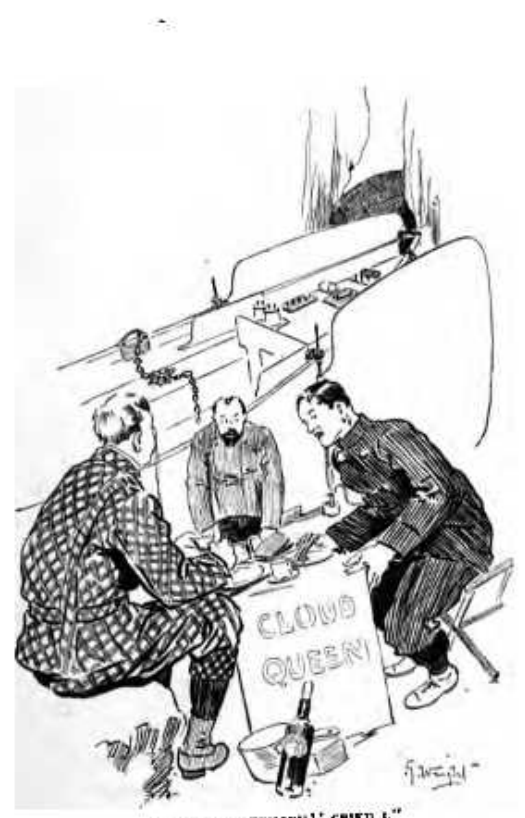
(See page 101.)