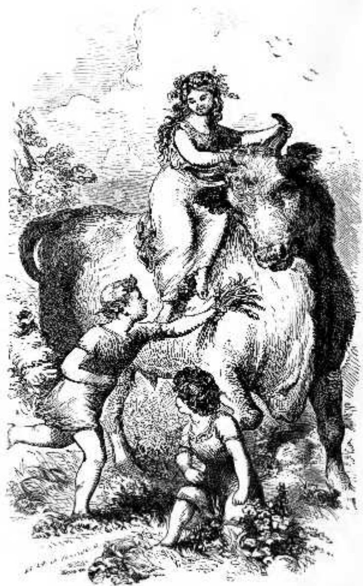
EUROPA AND THE BULL.