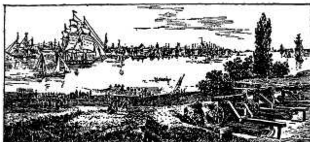
THE CITY OF NEW YORK

From Fort Columbus, Governors Island, reproduced from a print of 1816