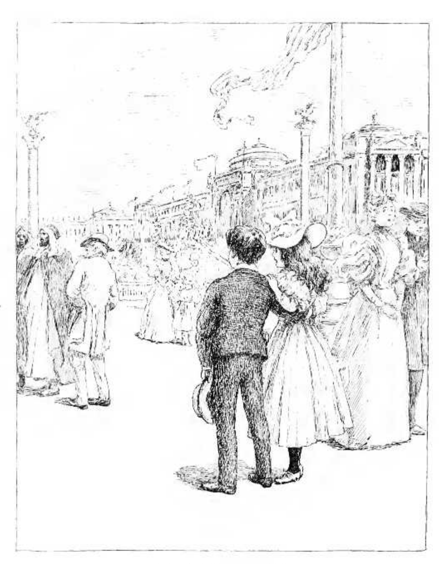
THURS DEEDS RAD COME TRUE.