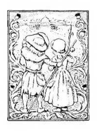
NEW-YORK CHARLES SCRIBNER'S SONS 1805