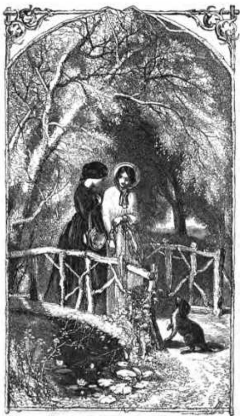
THE DAY OF REST.