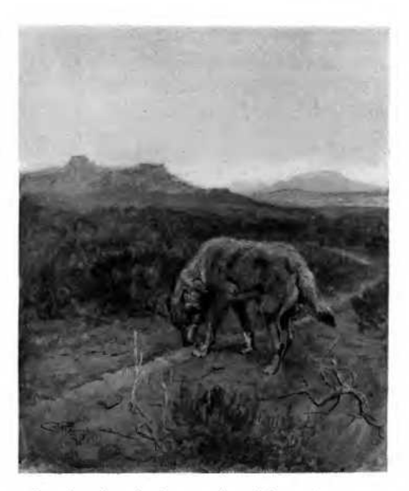
Out where the trails of men are dim and far apart. Frontispiece