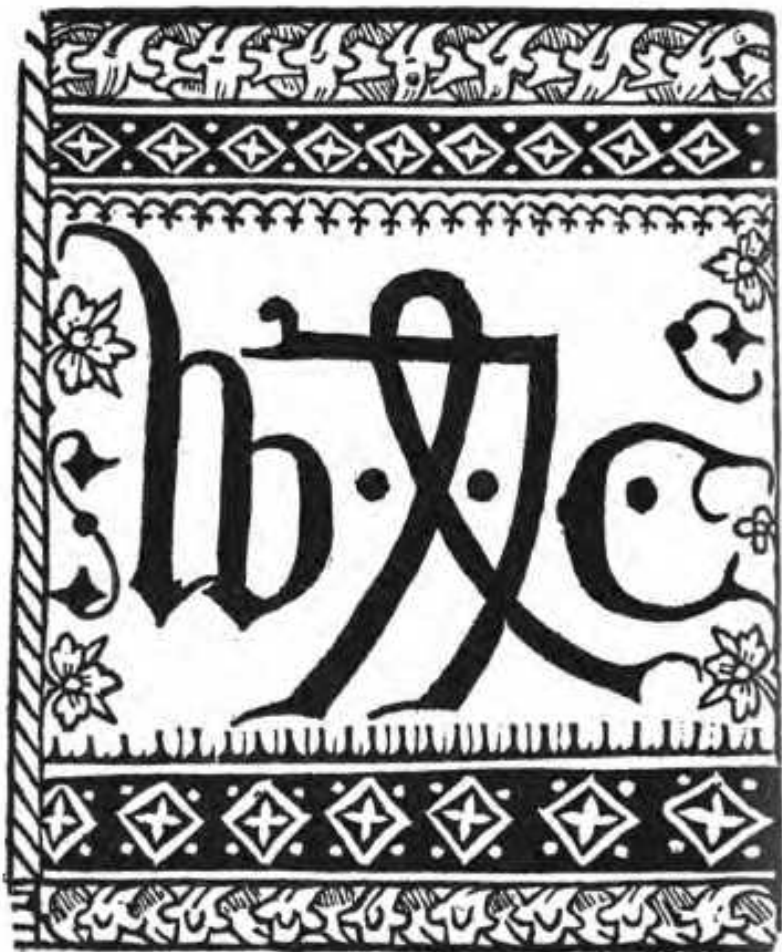
Caxton's device. ( Reduced )