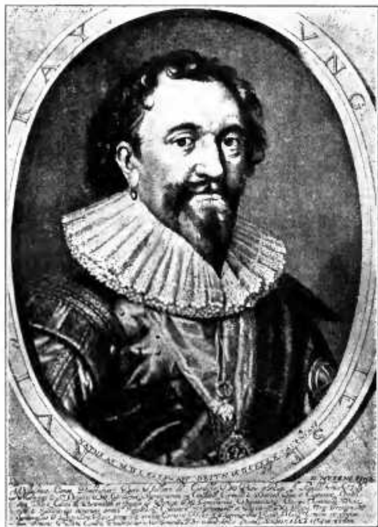
WILLIAM HERBERT, EARL OF PEMBROKE