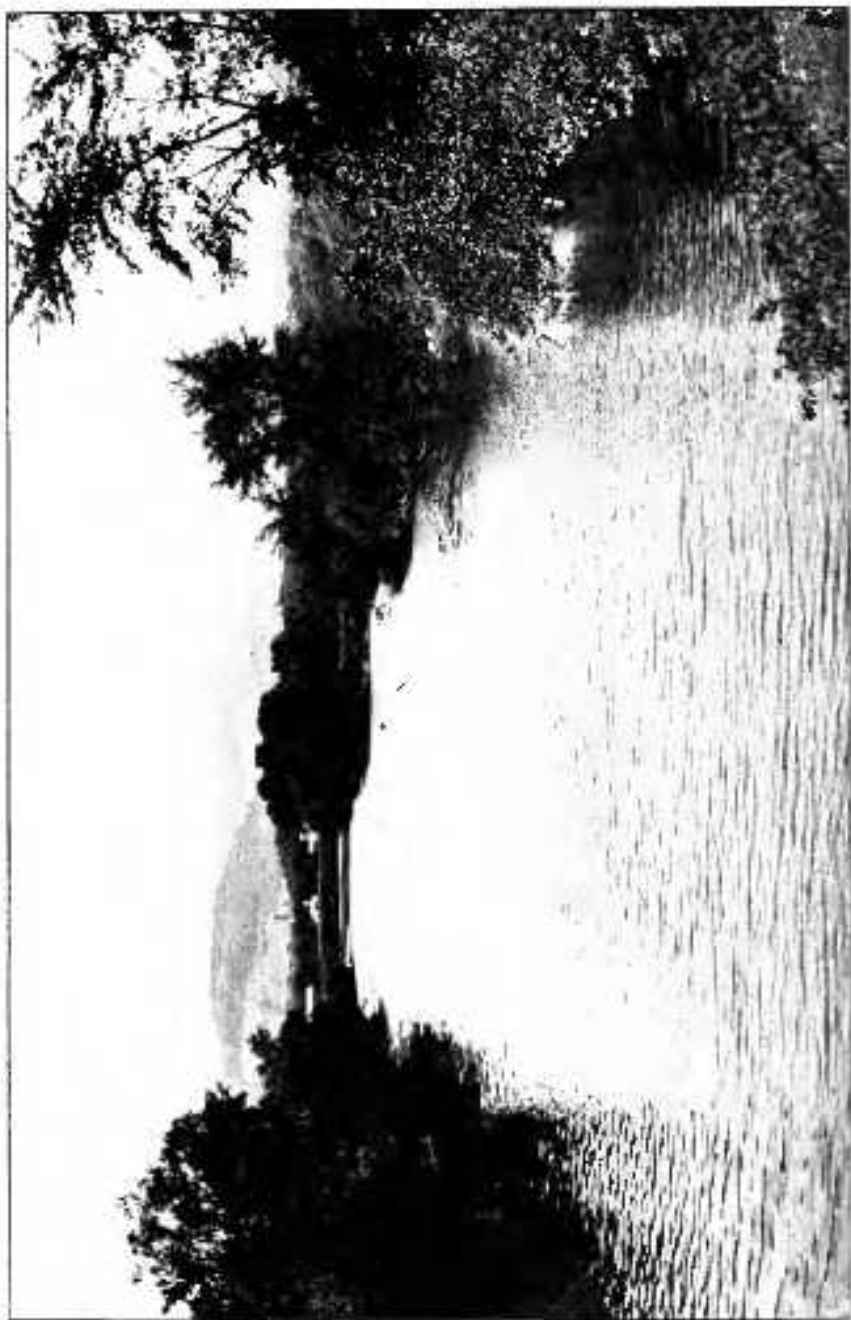
VIEW OF WILLIAMSTOWN FROM TROLLEY