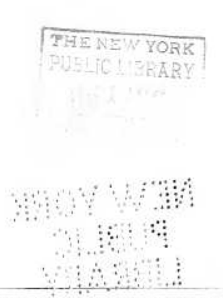
Entered according to Act of Congress, in the year 1573, by THE BIBLE AND PUBLICATION SOCIETY, In the Office of the Librarian of Congress, at Washington,