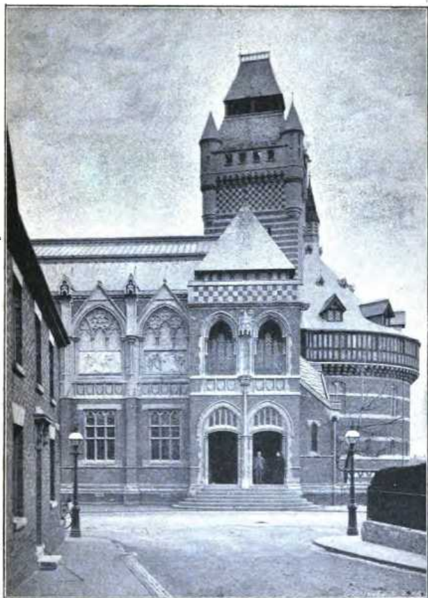
THE SHAKESPEARE MEMORIAL.