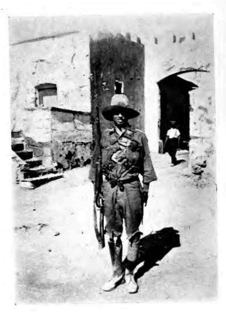
WHAT THE NATAL CARRINEERS LOOK LIKE AT GIBEON—SENTRY OUTSIDE THE HOSPITAL.