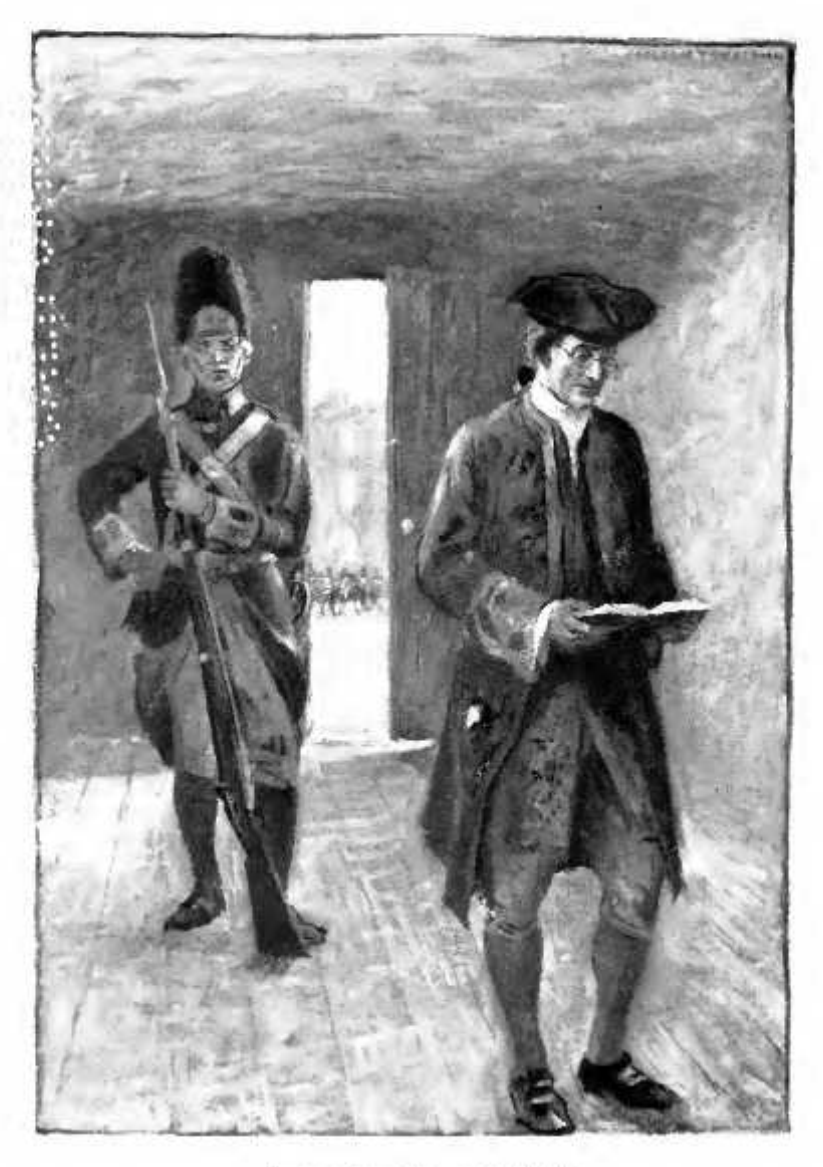
He was past the sentry now.