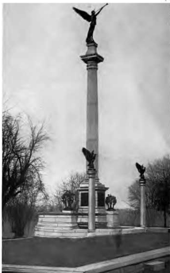
LOVEJOY MONUMENT, ALTON, ILLINOIS (Revised, 186-7)