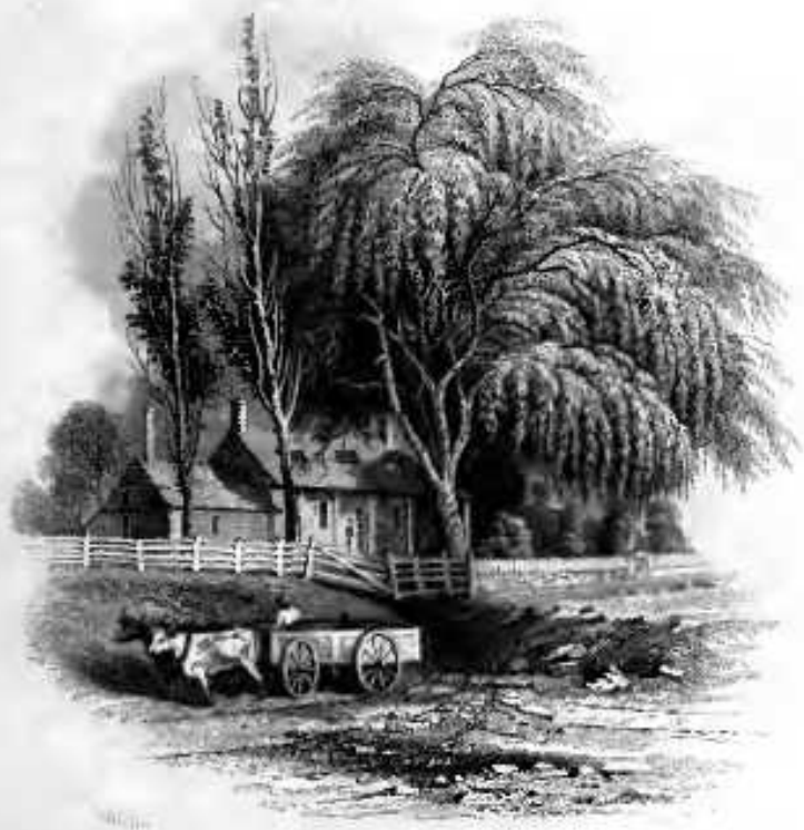
THE WESTERN HOME.