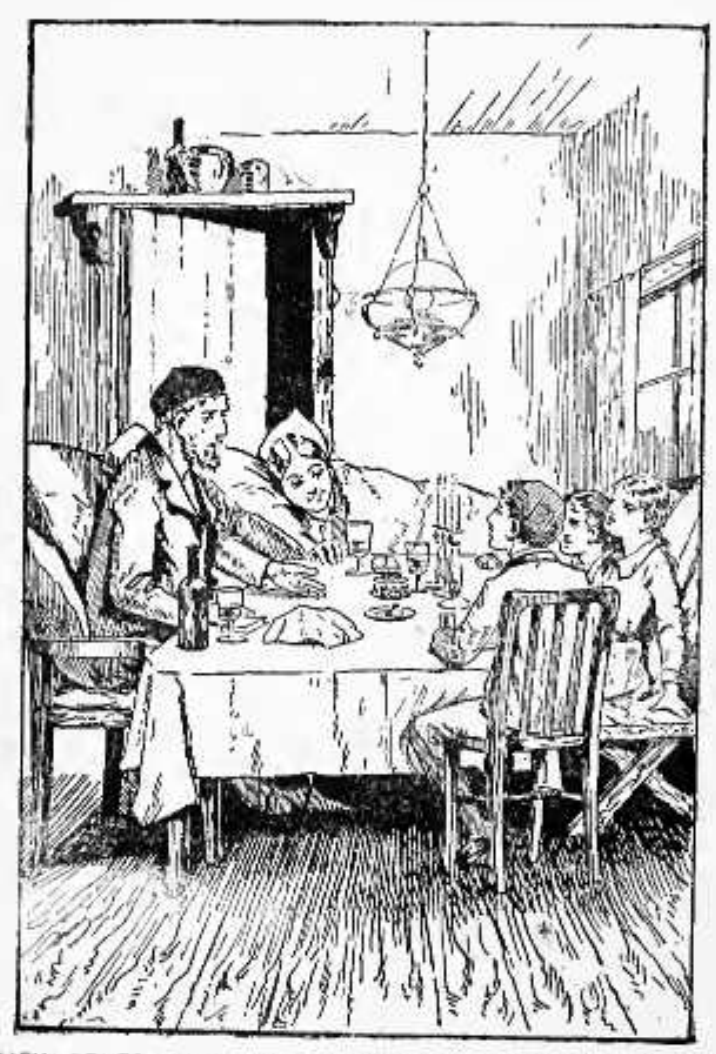
THEY CELEBRATED THAT FEAST OF FREEDOM AS THEY NEVER DID BEFORE—Frontispiece.