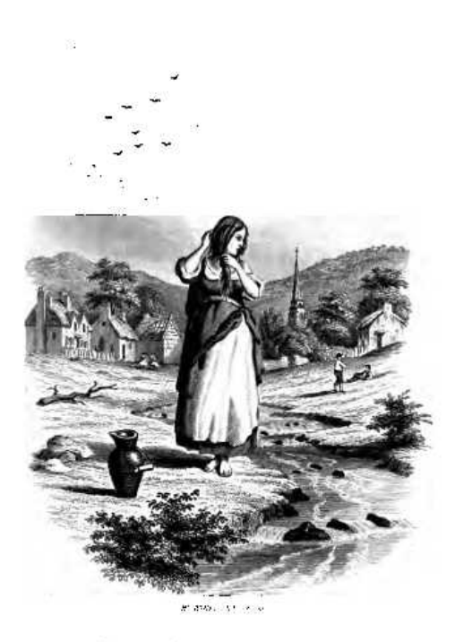
Cheltenham in the Olden Time