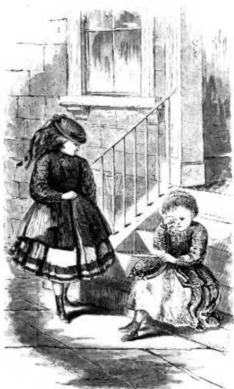
KITTY'S VALENTINE. Page 43.