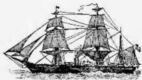
THE STEAM FRIGATE POWHATAN.

Still smaller than the frigates were the corvettes, or sloops of war, as they are more commonly called. These