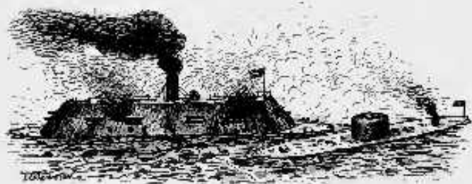
THE MERRIMAC AND THE MONITOR.

very successful. The earliest war steamships were driven by paddle-wheels, placed at the sides of the vessels. The paddles, besides taking up much valuable space, were exposed to the shots of the enemy, and in any battle were very easily crippled and made useless. But the speed of these vessels was much greater than that of any sailing ship, and this alone made them very desirable. For many