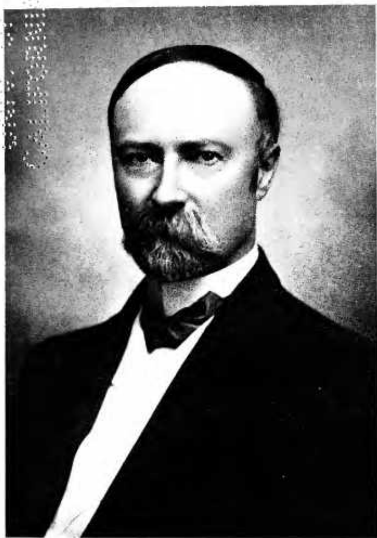
Charles W. Fairbanks