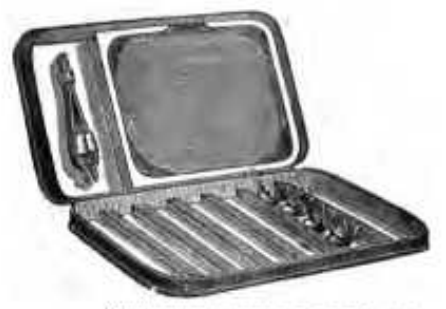
THE "TEST" EYED TROUT FLY AND CAST BOX.

This book contains the names of 36 most useful patterns, arranged according to the seasons in which they should be used, and with full printed instructions; 7in. long, 4in. wide; either Roan or Bussia. With one fly of each pattern sewn in.