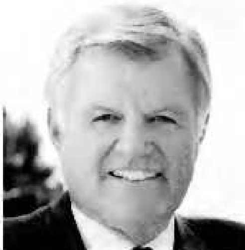
EDWARD M. KENNEDY Hyannisport, Democrat.