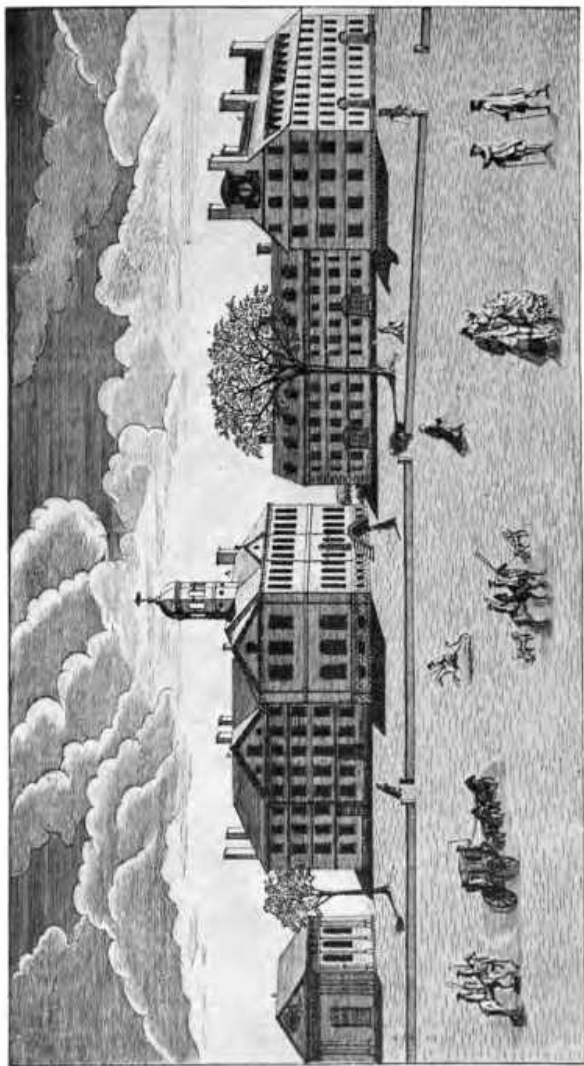
HARVARD OF YESTERDAY