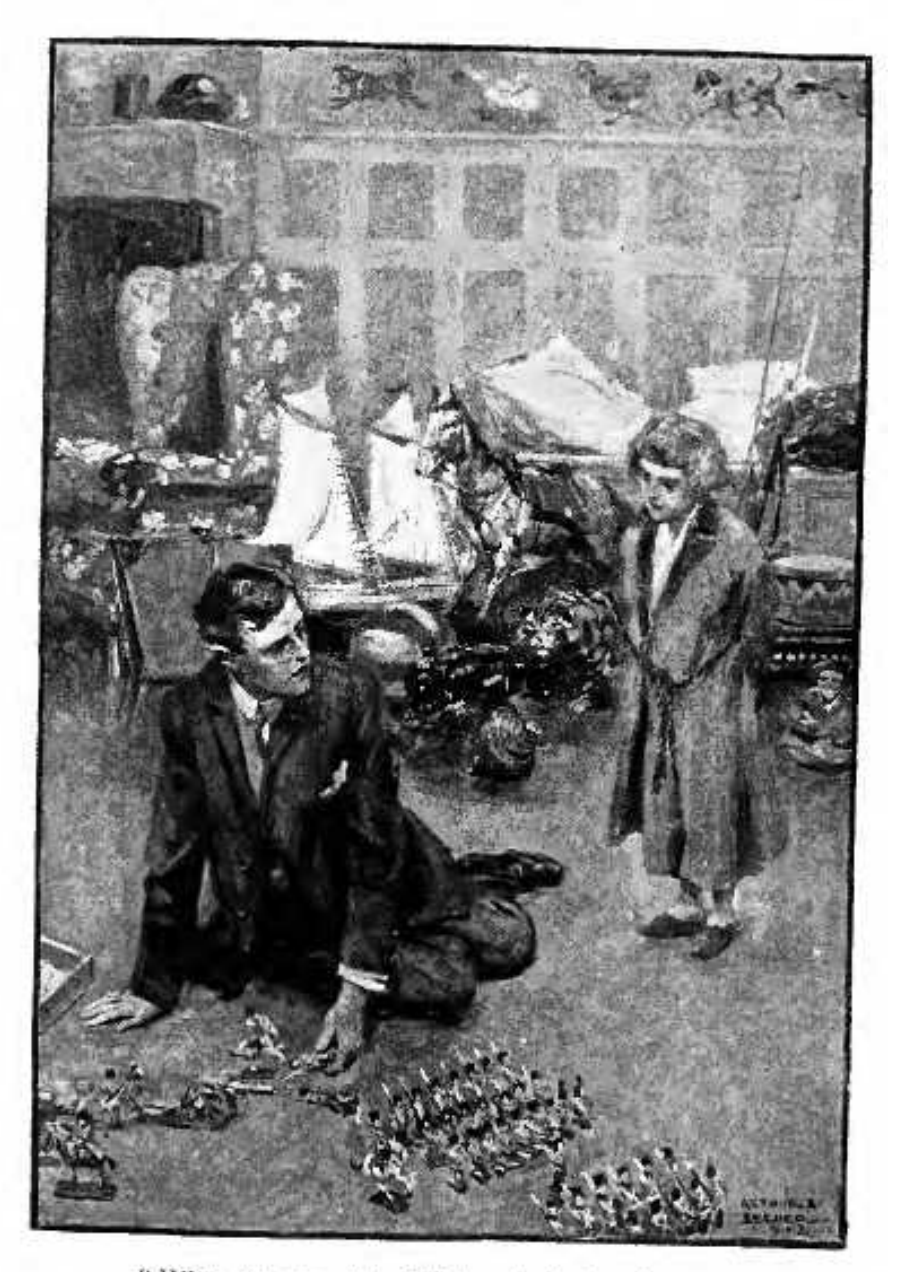
"What are you doing?" be asked, drawing near. FRONTISPIECE. See page 69.