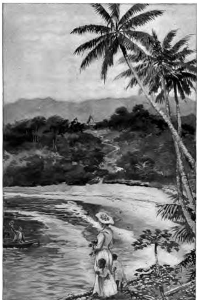
THE LANDING. (Page 79.)