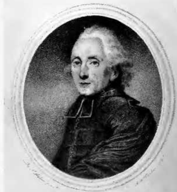
THE ABBÉ EDGEWORTH.