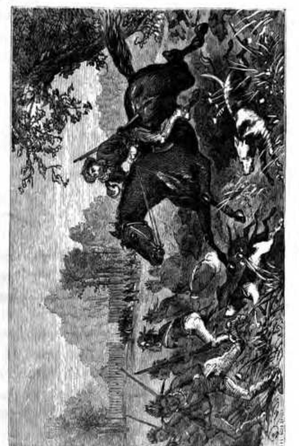
THE DOG CHARGE